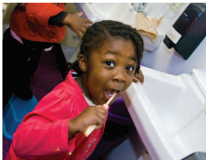
Preschoolers learn to eat well and brush thoroughly at The Genesis Center. Generous support from The Champlin Foundation helped us expand and renovate bathrooms at the preschool in 2009.